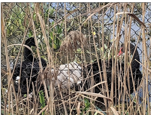
Photographed on 7 th August - a nest of at least four cygnets just inside the fence next to the viewing ramp.

Please send your payment, to our Treasurer at: PO Box 2031 EDITHVALE 3196.