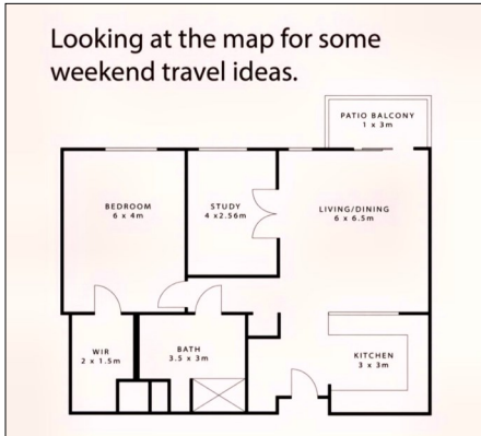
Looking at the map for some weekend travel ideas.